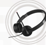
Lenovo Stereo 3.5 mm Headset