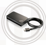
ThinkPad USB 3.0 Pro Dock