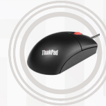
ThinkPad USB Travel Mouse