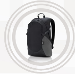
ThinkPad Active Backpack